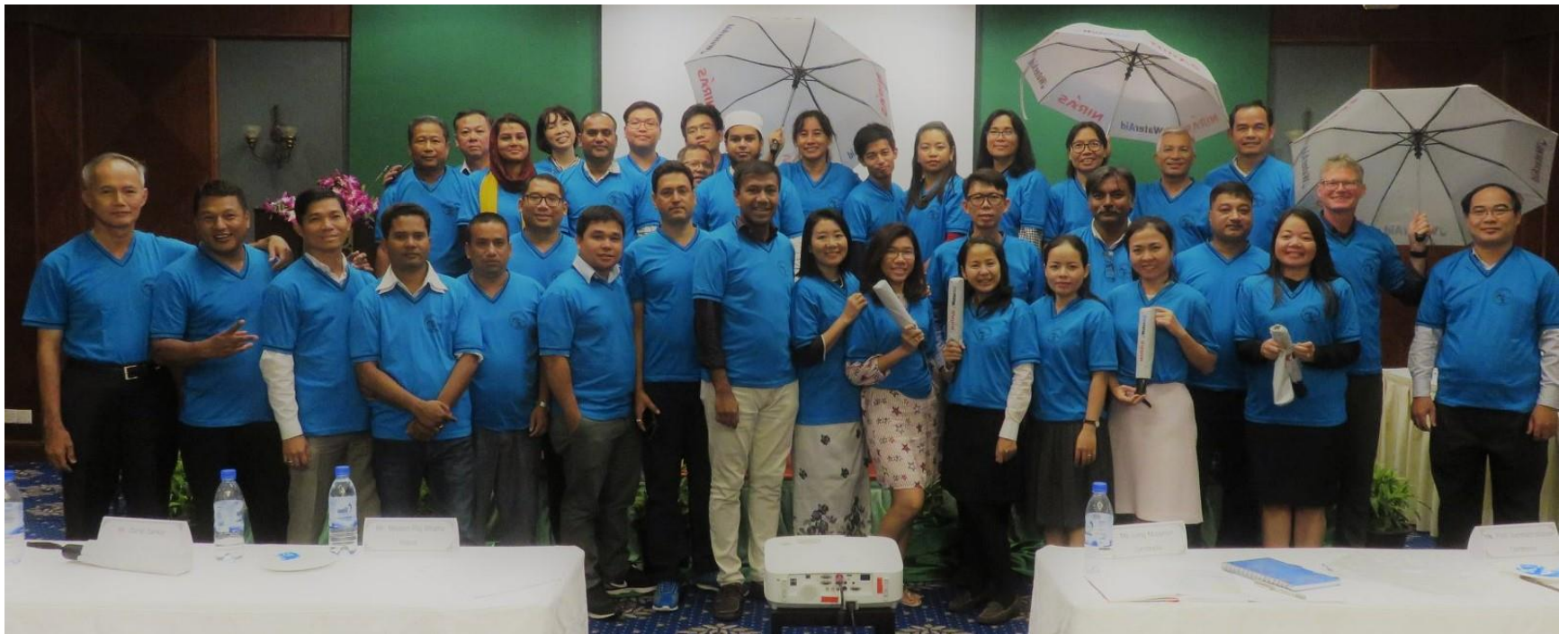
SUWAS 2018 A Team